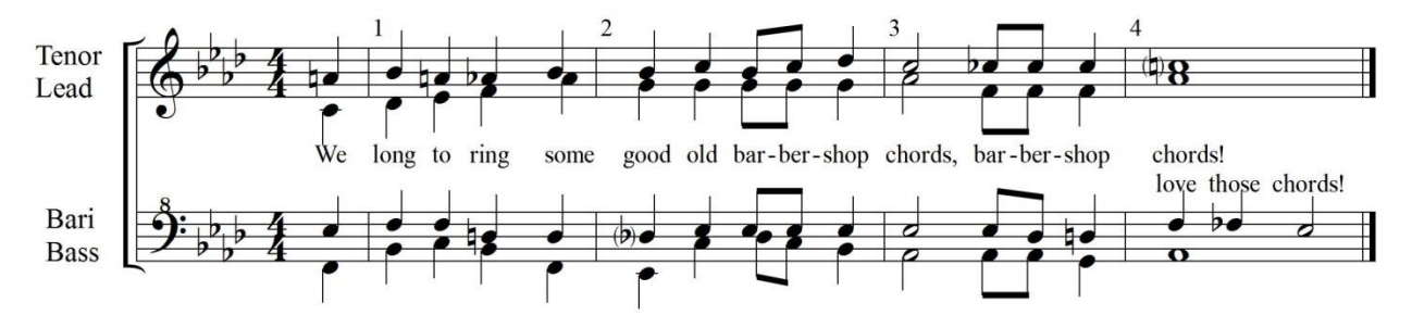
CC-BY-SA 4.0 International You are free to share and modify. Just include credit and keep this license with the new version.

Are you "hearing" a tag of your own? Your Barbershop Friends would love to sing it with you!