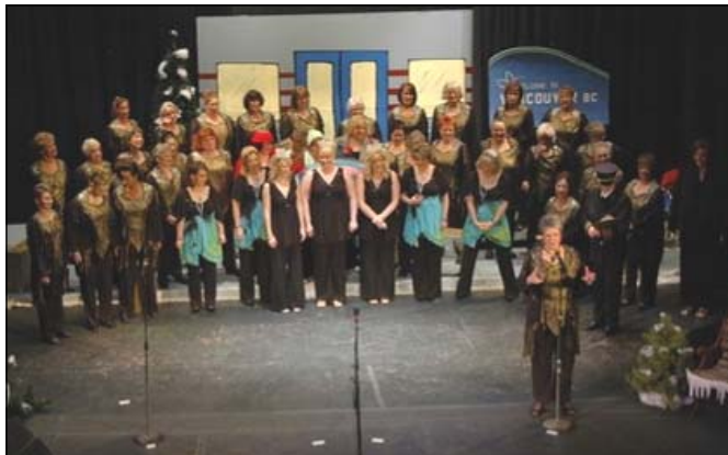
Voices Northwest Show finale