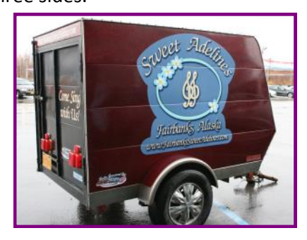
If you are behind it in traffic, you will (continued page 10)

Fairbanks is a great place to live and sing with your best friends. We have rehearsals 50 weeks of the year and we only consider cancelling one of them if it is -40 degrees or lower. We do a wildly successful fundraiser each February which, due to the hard work of each and every member, we earn (trumpets, please) about $12-14,000 each year. We used some of it to buy a riser trailer and have our chorus logo painted on three sides.