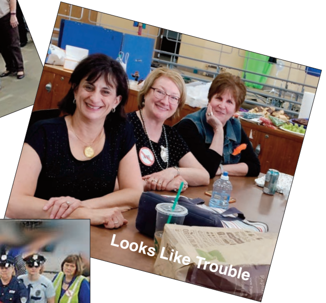
Looks Like Trouble