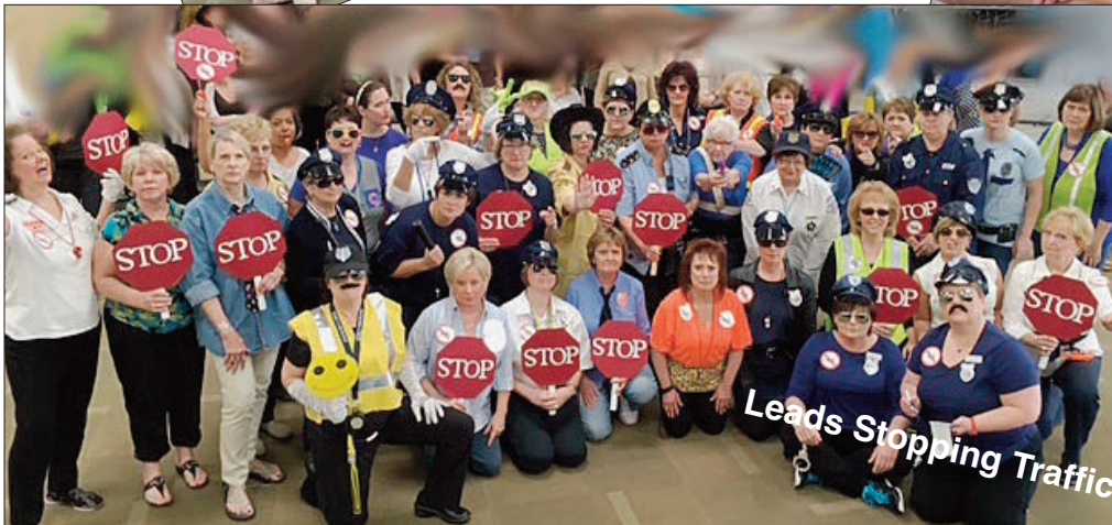
Leads Stopping Traffic