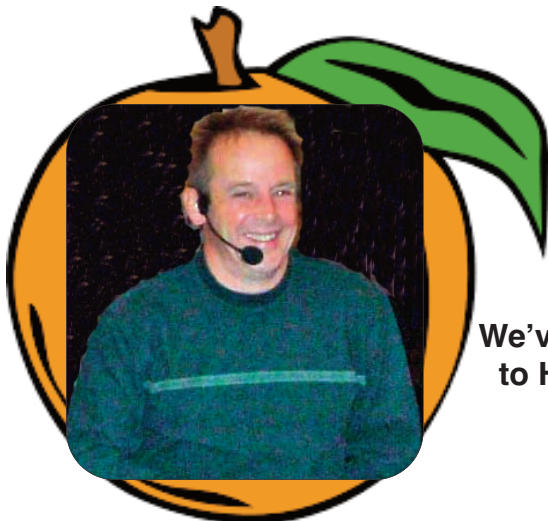
We've Grown Accustomed to His Face: His Smiles, His Frowns...