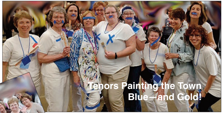
Tenors Painting the Town Blue—and Gold!