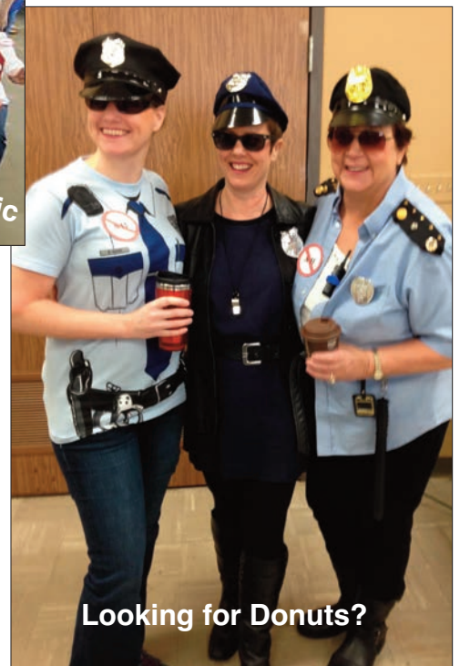
Looking for Donuts?