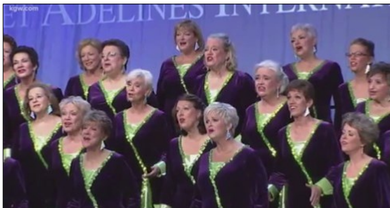
KGW.COM Pride of Portland finds harmony in hardship The pandemic has shown us that music can bring us together even ...

“Sweet Harmonies sung by a sisterhood.” These were the introductory words said during a recent interview with Pride of Portland Chorus and Portland’s KGW TV. We talked about how the recent pandemic has impacted many singing groups; how many SAI choruses run rehearsals using Zoom; and how we’ve bonded together and have found strength in each other. We were very excited and honored to help bring awareness to our organization.